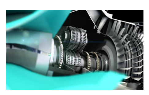
Figure 1. Granta MI supports Rolls-Royce in managing their cutting-edge materials.