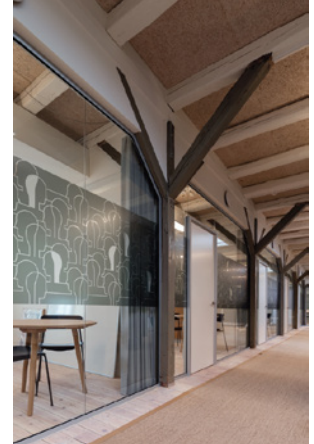
Figure 1 - Typical product from DEKO - glass with natural materials